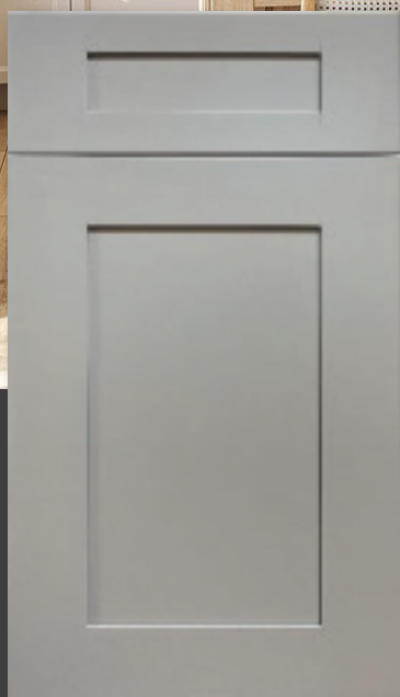
Gray Shaker SoHo (SH)