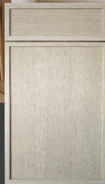
Oak Natural Slim Shaker Sandy Shore (SS)