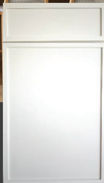
Off White Slim Shaker Mastic (MC)