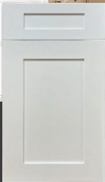
White Shaker Manhattan (MH)