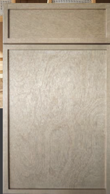
Birch Natural Slim Shaker Cortado (CO)